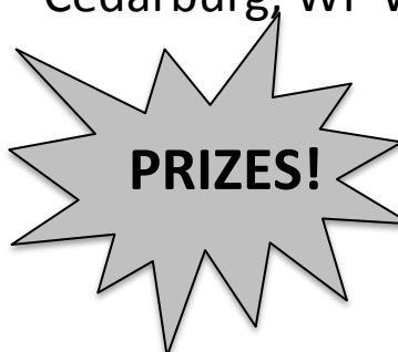
Table Spaces $10 (All Tables are 6') Buy 1 Ticket & 1 Table... just $15!

Wisconsin-Antique-Radio- Club-Inc-333900503344505